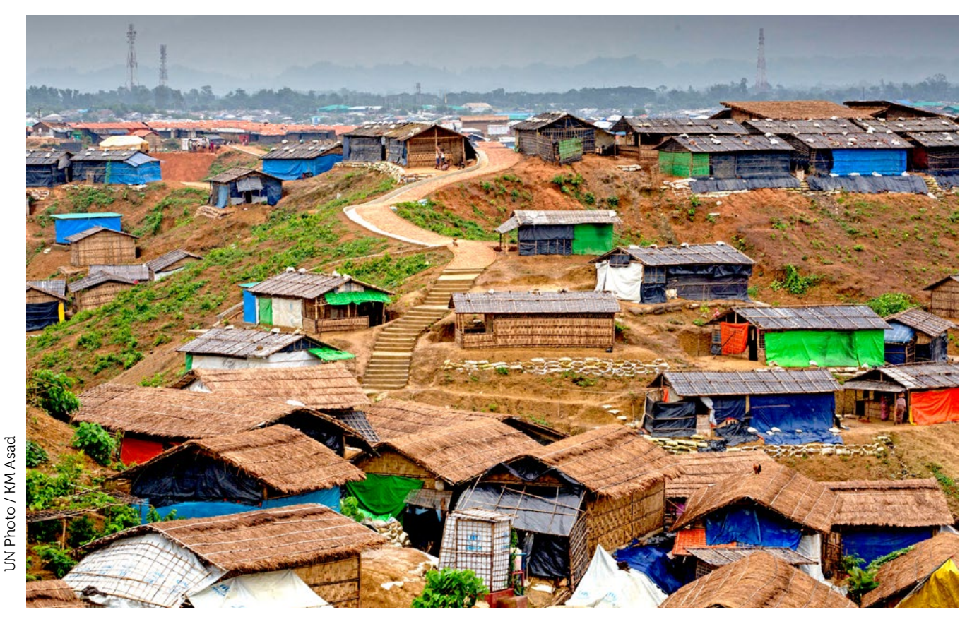
A view of the Kutupalong Rohingya Refugee Camp in Cox's Bazar, Bangladesh. In many remote areas, residents lack basic facilities and services. Social enterprises, with their focus on social impact, can help bridge this gap by providing customized services for those suffering from intersecting inequalities, many of whom are at the "last mile".

Social enterprises can carry out initiatives that complement broader structural responses to the challenges faced by those living at the last mile, creating a "multiplier impact effect" as they help vulnerable groups and generate positive externalities (Santos, 2012). Social enterprises may support and implement interventions focused on a wide range of development goals, including poverty reduction and environmental sustainability (Azmat, 2013).