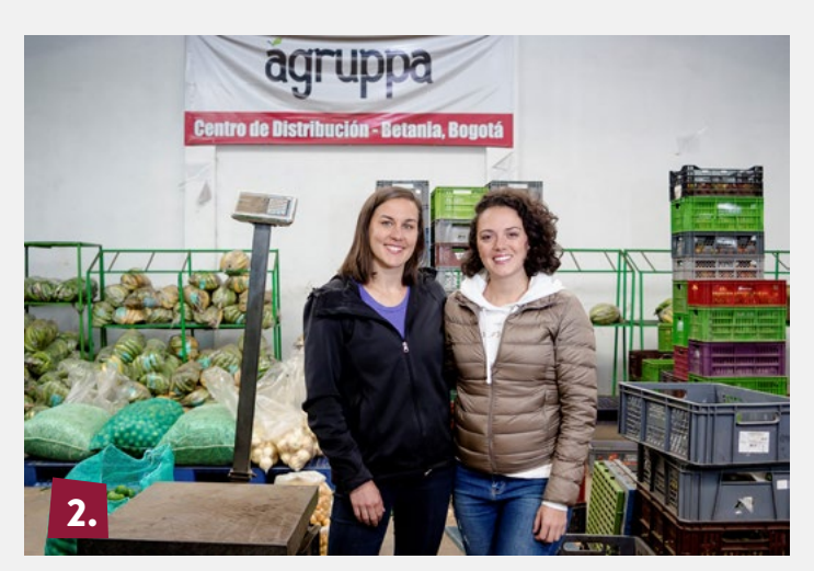
The Agruppa founders in their warehouse in Bogota, Colombia.

The Agruppa experience offers an important lesson. Although the social impact of the service provided had been confirmed through rigorous evaluation, not enough shop owners valued the service sufficiently to stop shopping at the central market altogether, making the business model unsustainable. This mismatch between objective social impact and perceived value within the target group highlights the importance of seeing the poor as customers with distinct needs and preferences that are not necessarily aligned with development theory.