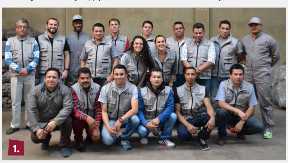
The Agruppa team in their warehouse in Bogota, Colombia, before their daily round of deliveries.

An awareness of the inefficiencies in the supply chain is what led to the creation of Agruppa, a virtual buying group for small urban shops that could aggregate the demand for fruits and vegetables in order to buy directly from the farm, bring produce to a distribution centre in the city, and distribute to the shops based on their orders. With the reduced transport and produce costs, Agruppa could save each shop owner up to six minimum-wage salaries per year (approximately $1,700) while at the same time giving the farmer direct access to a market in the city.