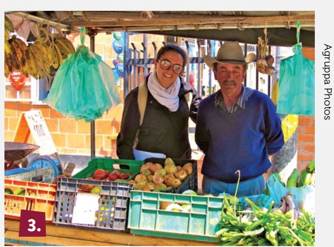
One of the first Agruppa customers on the streets of Bogota, Colombia.

WORLD YOUTH REPORT: Youth Social Entrepreneurship and the 2030 Agenda