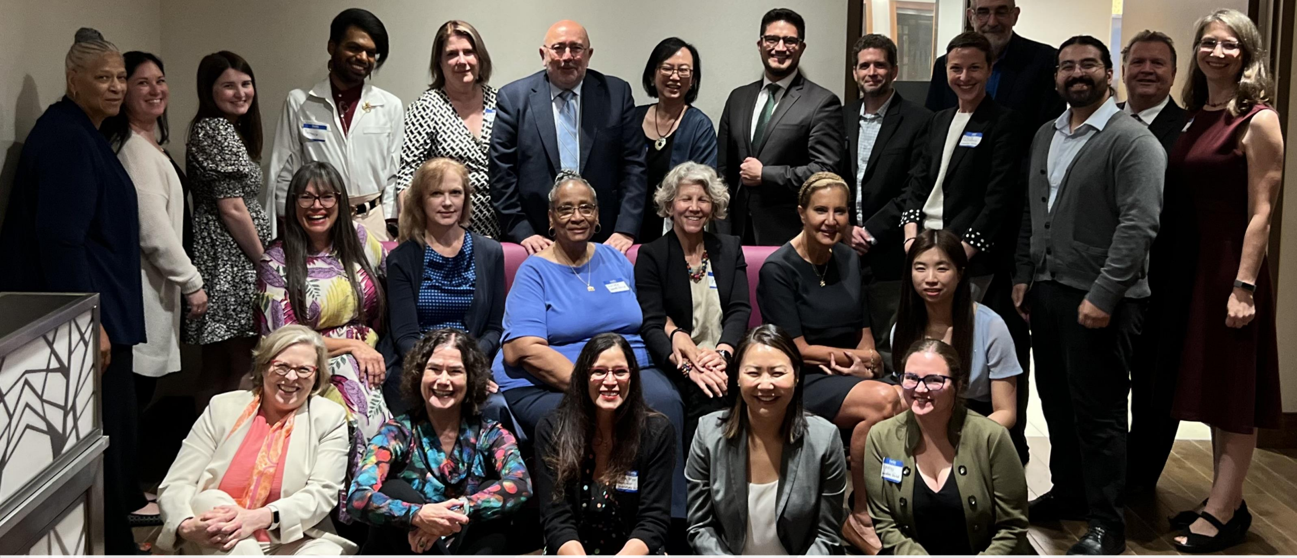
Experts and Observers